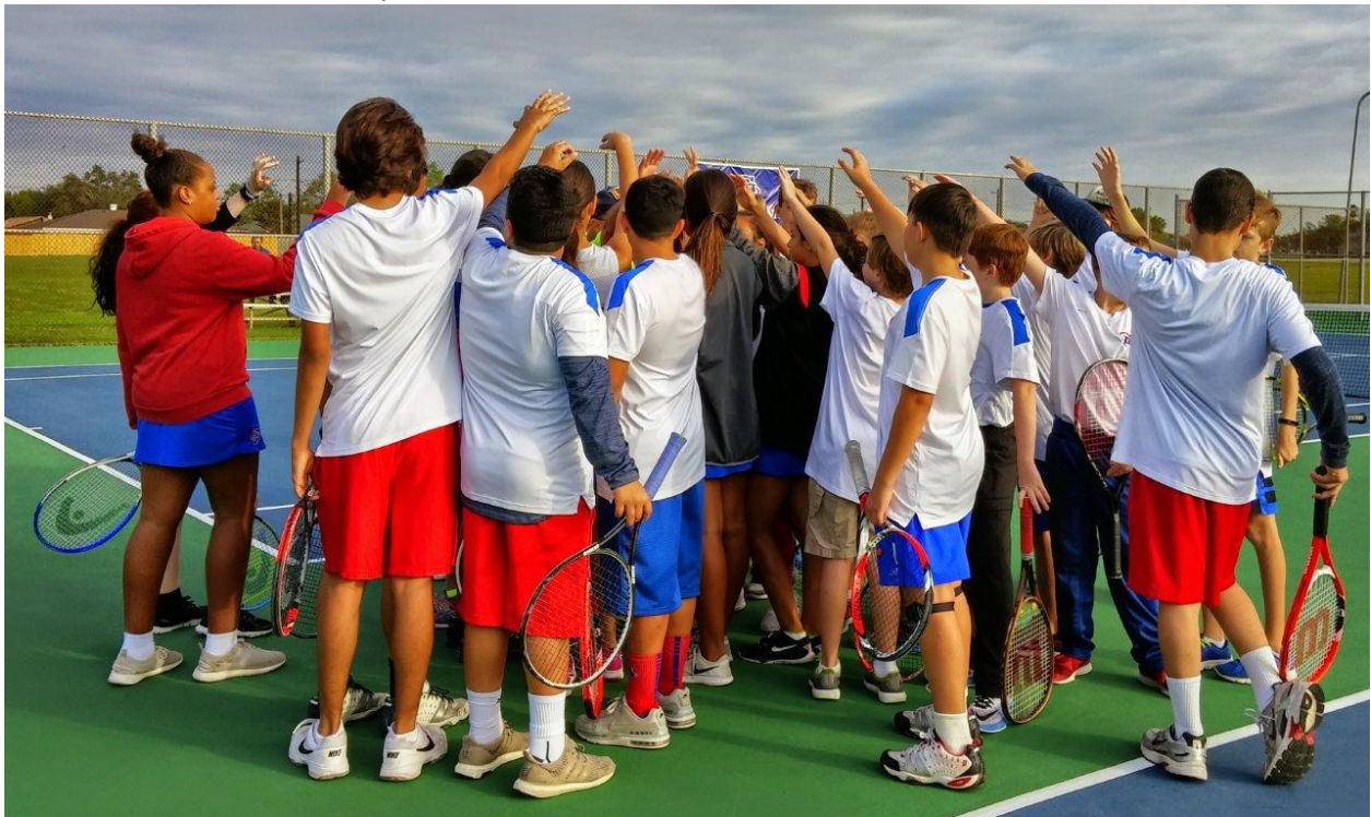
Raise your hand if you're a winner!